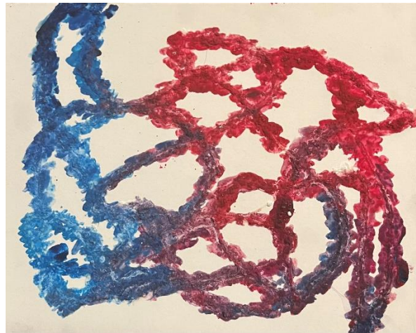
Salt and Glue Technique