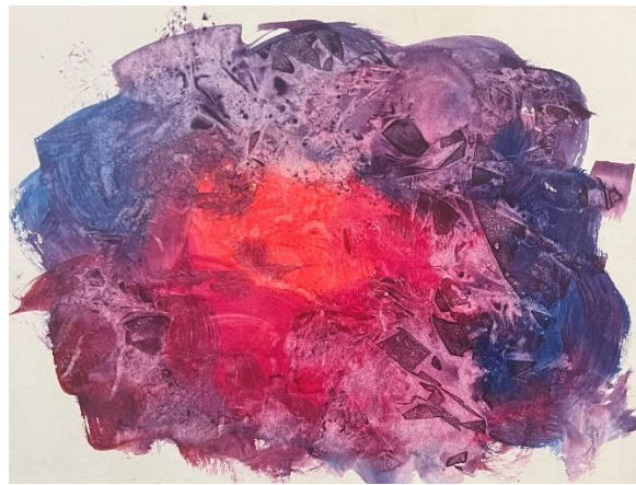
Plastic Wrap Technique